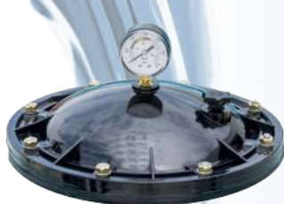
ABS Filter Lid