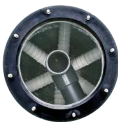
ABS Collector Arms