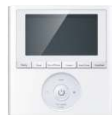
Wired Controller KJR-120G2-S2 (included) KJR-120G2-M2 (optional)