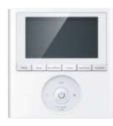
Wired Controller KJR-120G2-S2 (included) KJR-120G2-M2 (optional)