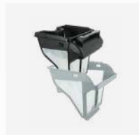
Filter canister Dual stage filter: 150/60µ