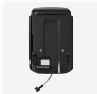
Charging and storage station