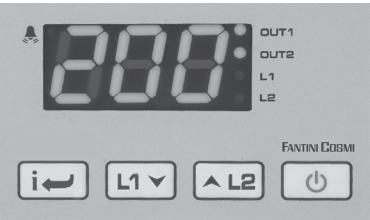
Fig.1 - Front panel

Thank you for having chosen a Fantini Cosmi product. Before installing the instrument, please read these instructions carefully to ensure maximum performance and safety.